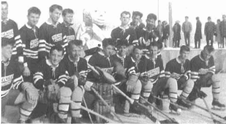
Equipe "Noëlville Juniors" (1963)