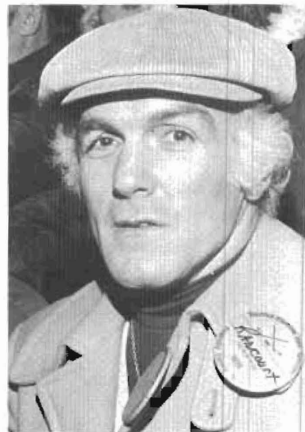
HENRI RICHARD, invité d'honneur du tournoi de familles 1978