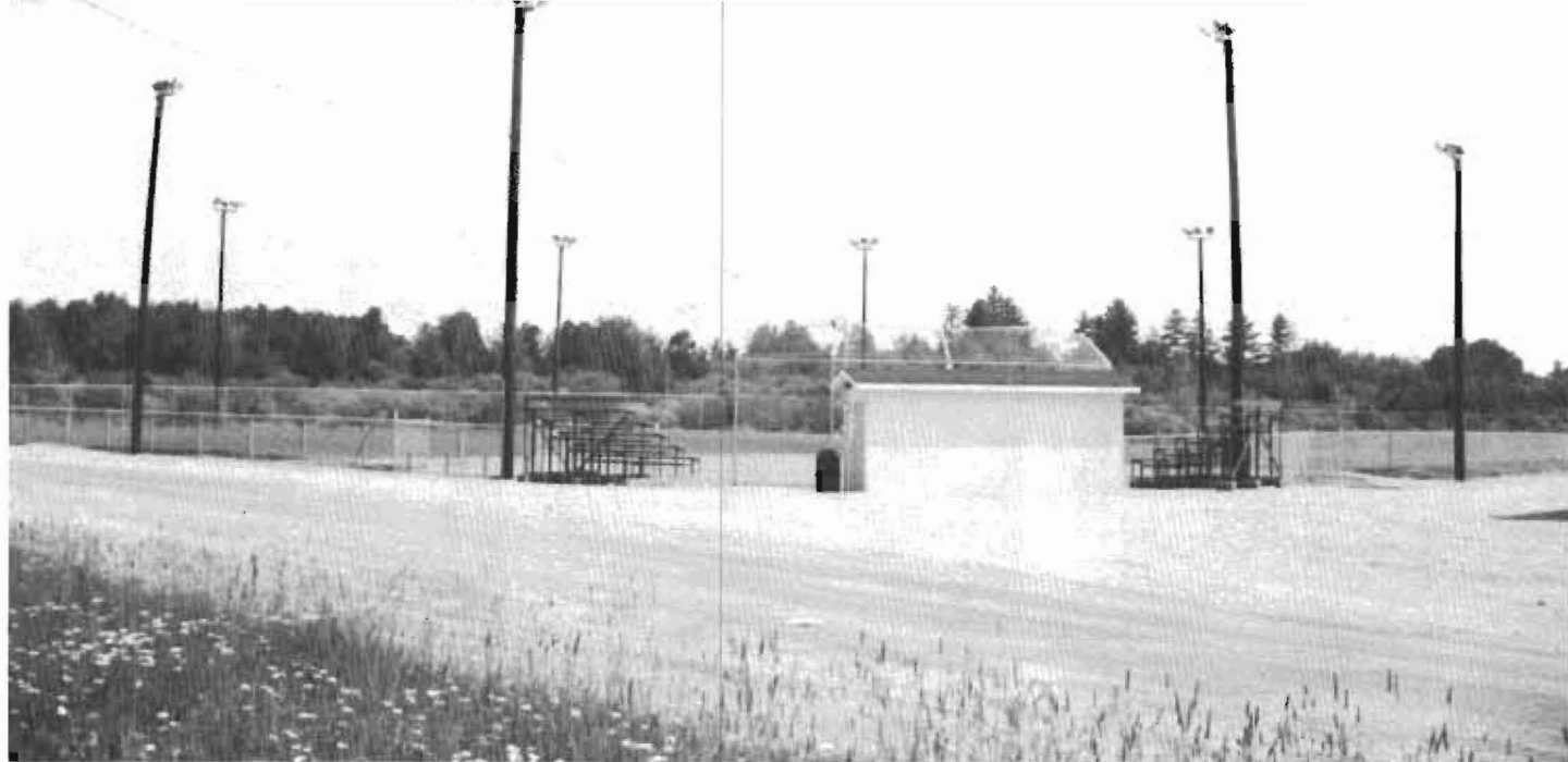
Dernière addition au complexe sportif - UN CHAMP DE BALLE