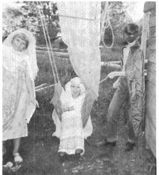
Des loisirs d'enfants! (1966,