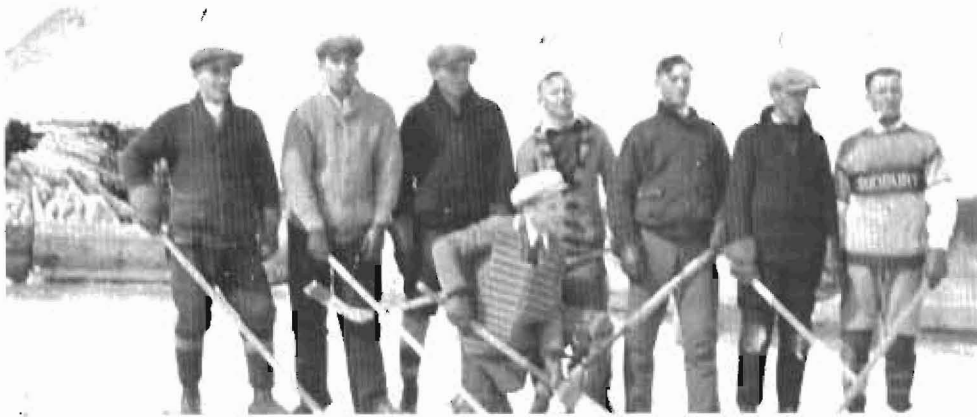
Equipe de hockey des années 1930