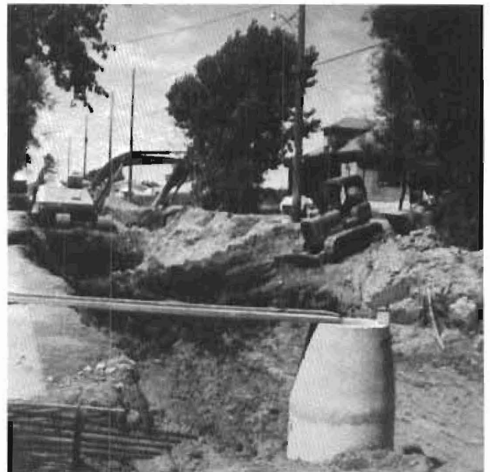
LA CONSTRUCTION D'EGOUTS A NOELVILLE