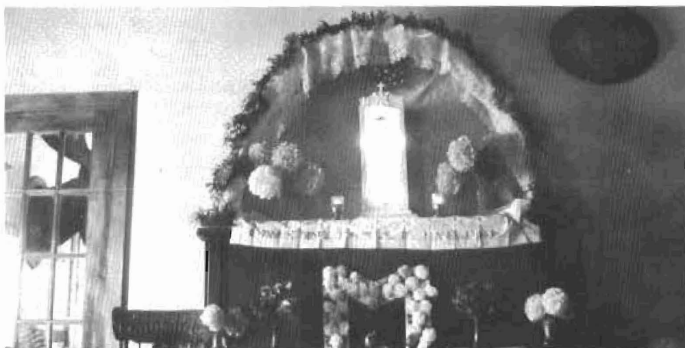
La statue de Notre Dame du Cap se promenant de maison en maison