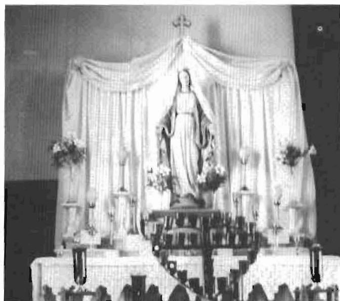
Décoration de l'autel de Marie