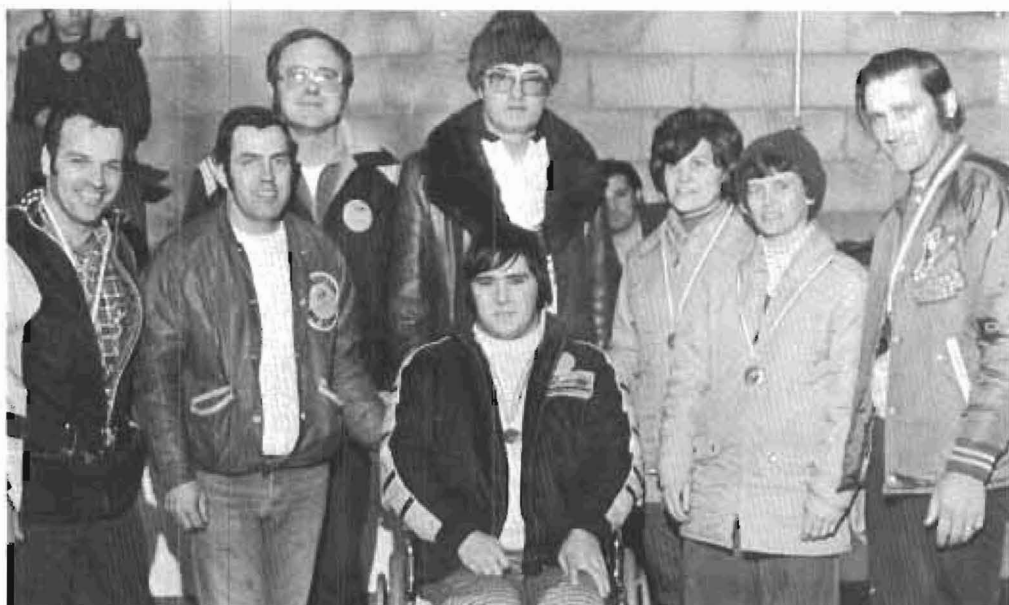
Le lieu de rencontre tout au courant de l'hiver - LE CENTRE COMMUNAUTAIRE