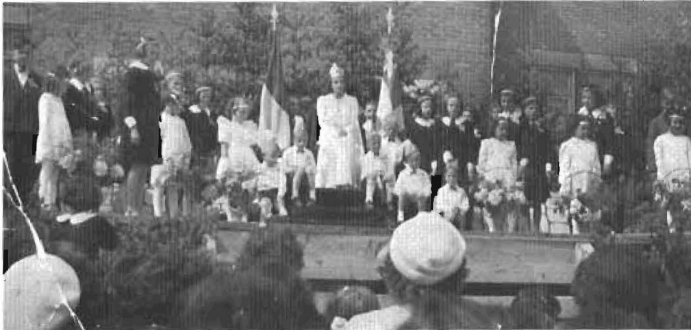
Une pièce de théâtre de Noëlville représentée à Verner pour le concours de français