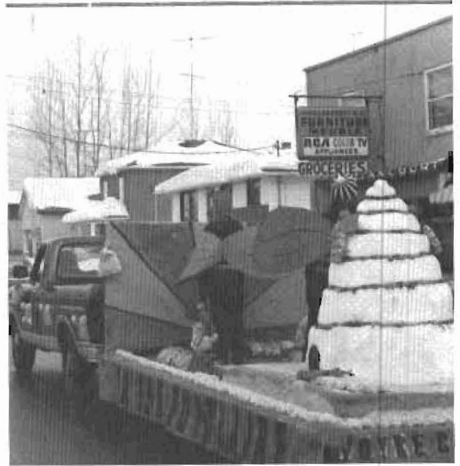
Char allégorique de la Caisse Populaire