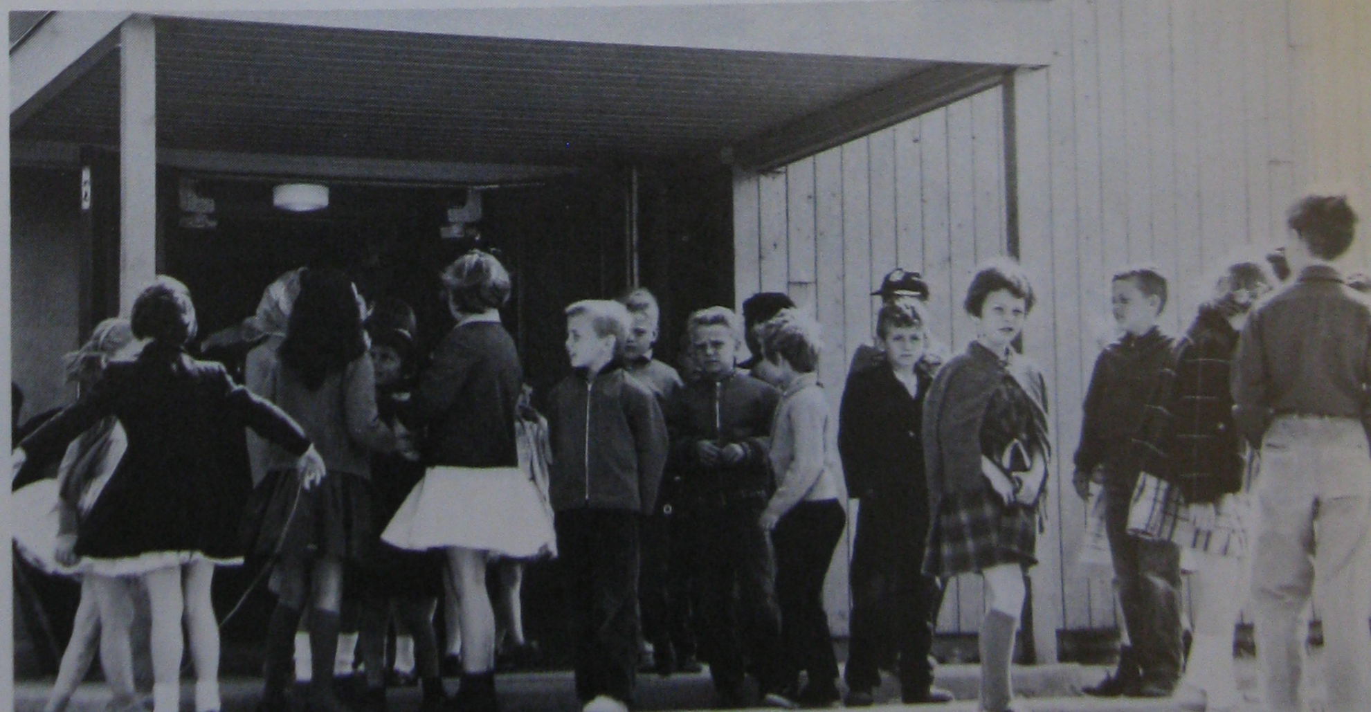
BOTTOM: Manitouwadge boasts modern and extremely well-equipped schools. Here a group of junior students is waiting for the bell to call them into class.