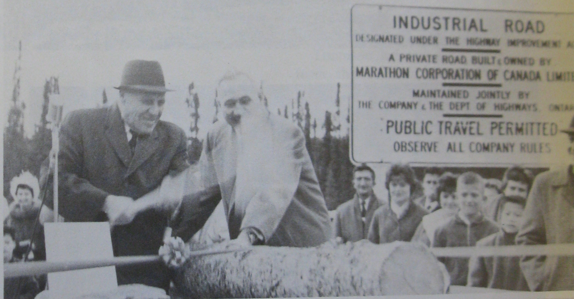
MIDDLE: In 1962 the Hon. George C. Wardrop, who was then Minister of Mines, used a lumberman's broadaxe to cut the ribbon officially opening the road link from Manitouwadge north to Highway 11.